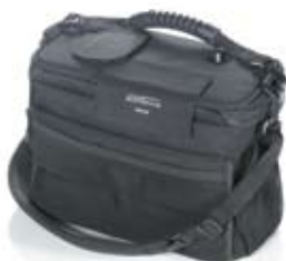
EverGo portable oxygen concentrator

For more information on EverGo, talk to your homecare provider or visit evergo.respironics.com .